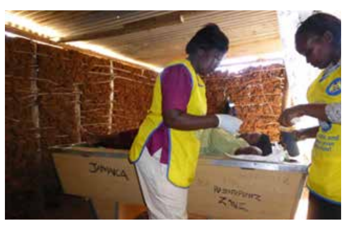
Family planning – inserting implant

The family planning hut was somewhat larger. Light was provided by fortuitous gaps between the top of the mud walls and the corrugated iron roof. The treatment couch was a small pool table with a rug on top. How or why such an item got to such a remote location was not clear! Local women had learnt about available contraceptives through training visits by Dandelion staff. Almost all chose long-acting, reversible options, most preferring implantable formulations. These are inserted under the skin in the upper arm – a 5-minute procedure under local anaesthetic that provides effective contraception for 3 years, but can be simply removed at any time. These procedures were undertaken smoothly and efficiently by experienced nurses under sterile conditions. A reasonable degree of privacy was provided by a sheet hanging from the roof for the few who chose IUD's (intra-uterine devices, effective for up to 12 years) or who wanted cervical cancer screening. Many women were anxious that their husbands should not be aware that they were using contraception. During the day, 115 women received implants.